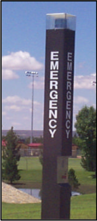
Emergency telephones are located throughout campus for easy access to help.