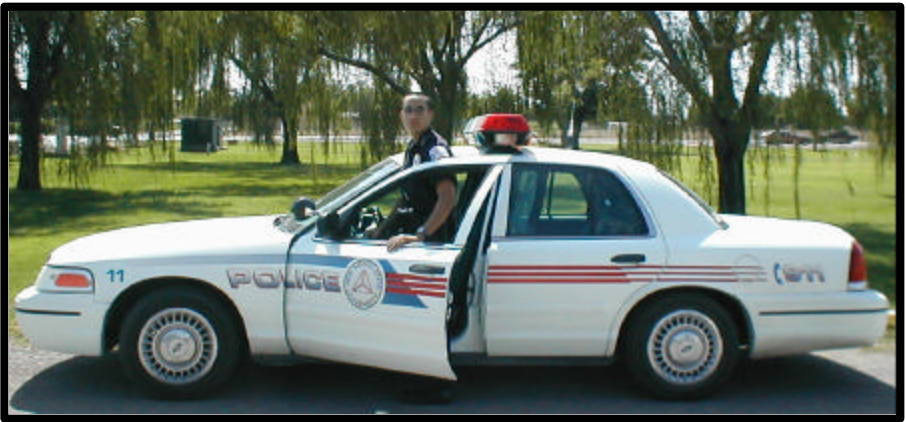
Officers patrol the main campus 24-hours a day, all year long.

Additional services exist throughout the community to deal with special problems. Students may contact the NMSU Police Department with their needs for referral to the appropriate people or organizations.